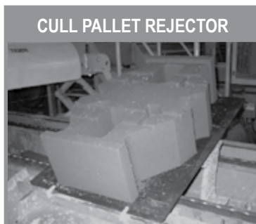
CULL PALLET REJECTOR

TIGER reserves the right to change, discontinue or improve product design and specifications without prior notice.